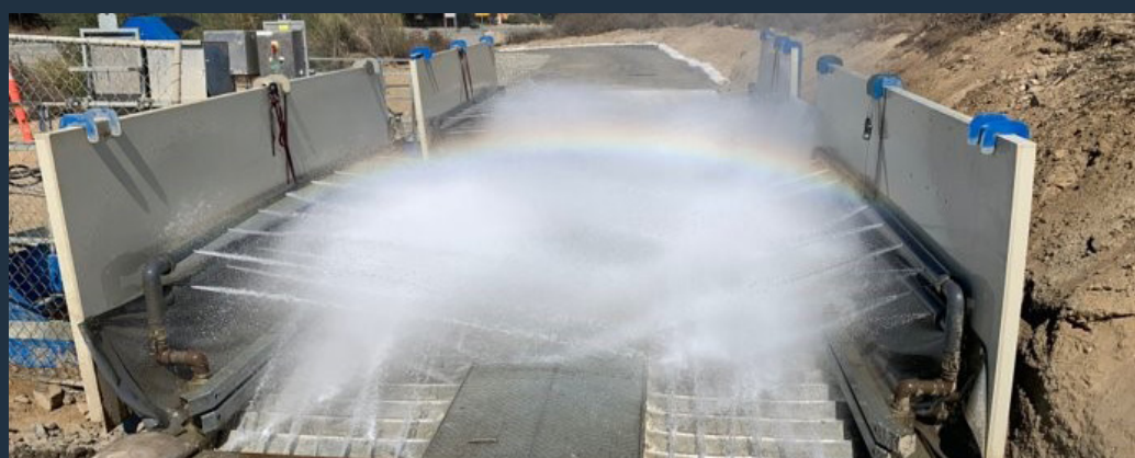
Each truck goes through a tire washing station before leaving the reservoir.

Upon completion in 2022, the County will begin an annual maintenance program to sustainably manage future inflows of sediment. The new configuration will allow native habitat areas to flourish alongside reservoir flood control operations for both the safety and well-being of adjacent communities.